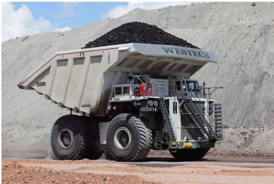
Westech, makers of the World's Largest Coal Body Guinness World Record 2011

Our strategically positioned manufacturing plant in Casper, Wyoming enables us to serve North America and export overseas as well. Westech offers paid holidays, vacations, medical, dental and life insurance, prescription drug plan, short term disability and 401(k) plan.